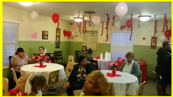
Residents enjoying dancing at the Raymond Skinner Center

We had a scavenger hunt at the Hickory Ridge Mall. Here is a picture of the winners! In an effort to be more active, We are adding exercise as a part of our outings. We hope to have more residents join us as we walk and move to fight depression!